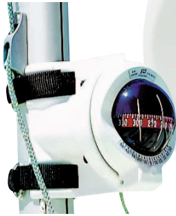
Mast mount kit 14077