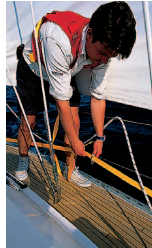
Philip Plisson ©