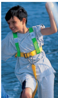
Philip Plisson ©