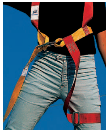
Philip Plisson ©