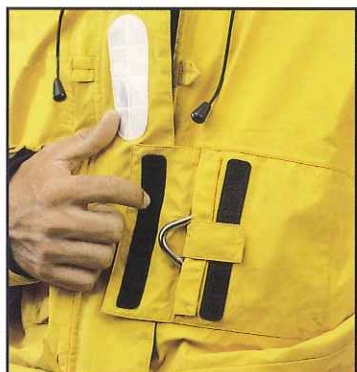
Tunnel for safety harness, with flap and tab to secure buckles