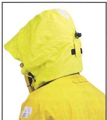
Fluorescent yellow stowaway hood with reflective tape for increased visibility. Drainage channel deflects water from face and neck. High visibility stiff peak. 3-way hood adjustment: width, height and face. Hood stows in collar with Velcro® closure.