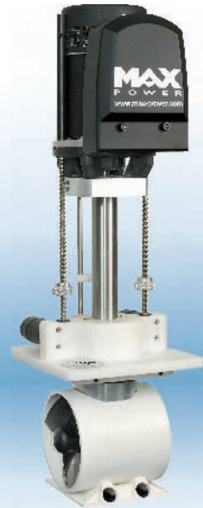
VIP 150 Electric