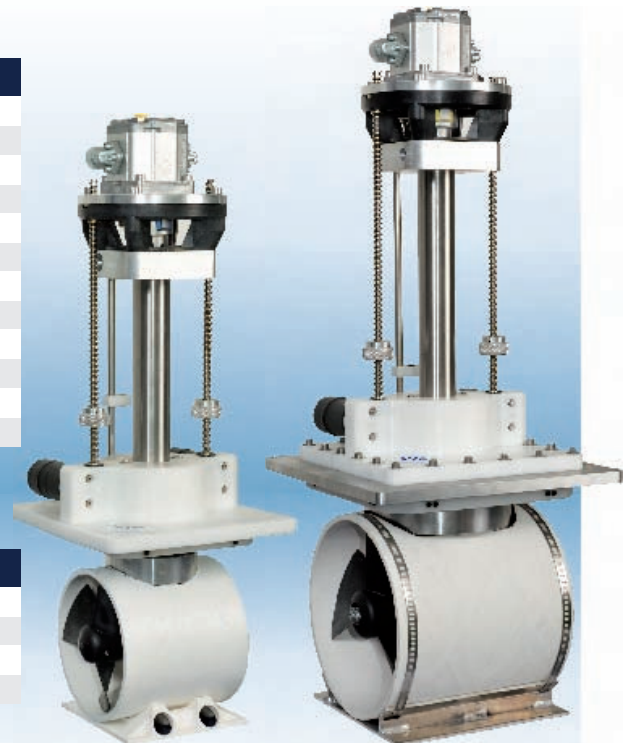
VIP 150 Hydraulic